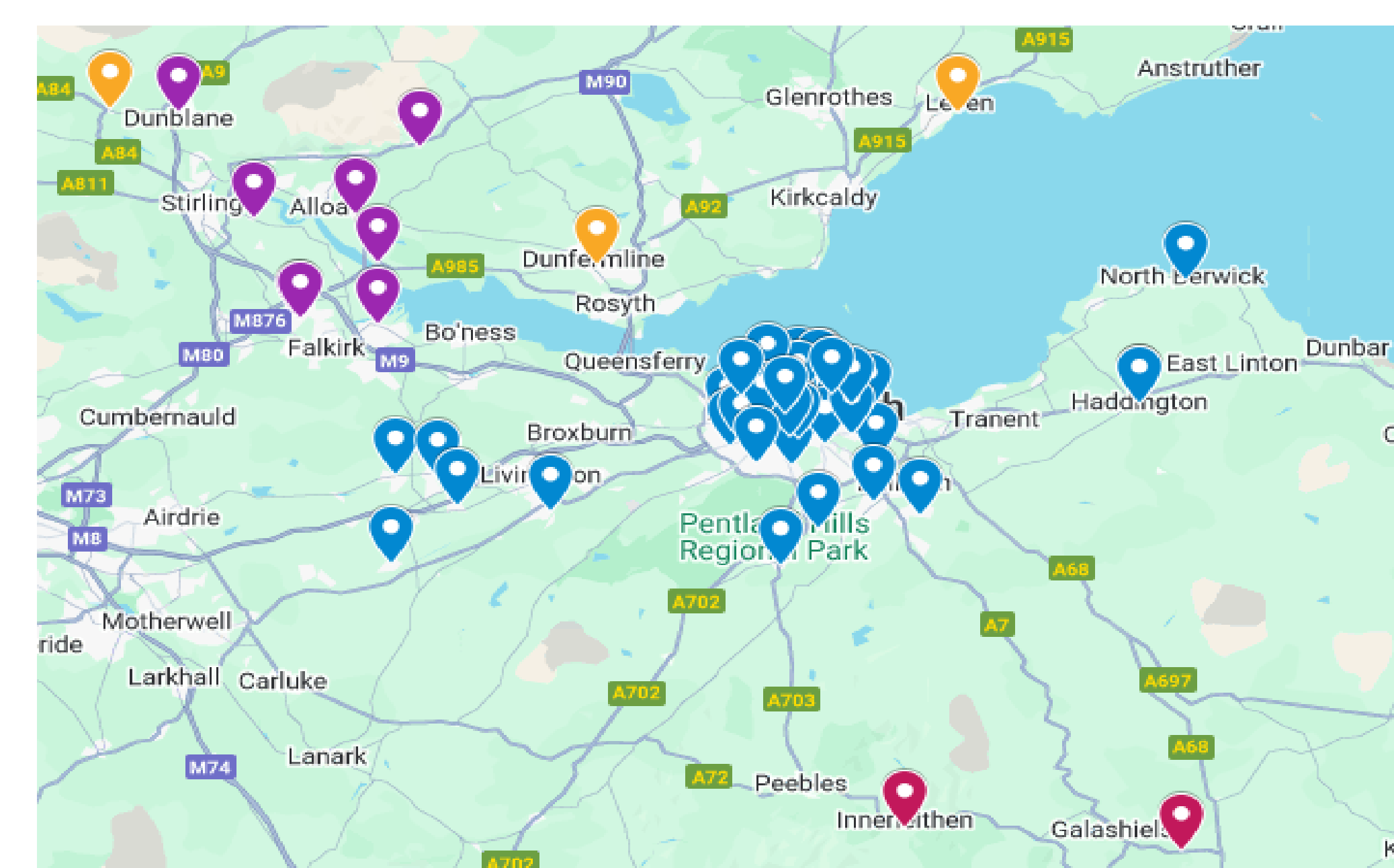
Figure 1. Location of practices that took part in SCOT-HEART 2 across Lothian , Fife , Forth Valley and Borders .